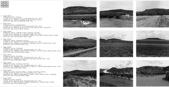
(c) Susanne Jakszus und Martin Scholz

The center of this project is the wine-landscape. Since 2006 they have been visiting wine-landscapes to document these areas in a photographic way and to establish an archive of these wine-landscapes. This archive serves as a source for the configuration of series of photos, which deal with the worldwide impact of viniculture on landscape. Apart from the beauty their ambition is to demonstrate the structures, commonness or characters of wine-landscapes and to demonstrate a pictorial representation of the complex and amazing production of wine in a visual level.